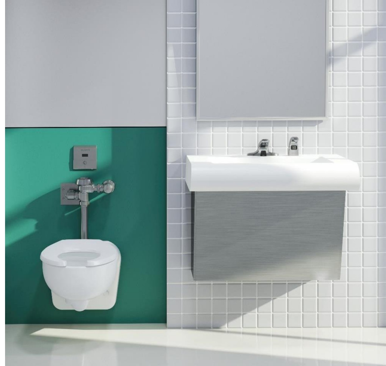
Shown: SloanStone ELRF-81000 Round Front Sink with EBF-650 Faucet and ESD-600 Soap Dispenser, Royal 111 ESS Flushometer with ST-2459 Wall-Hung Water Closet

https://standard.wellcertified.com/nourishment/hand-washing