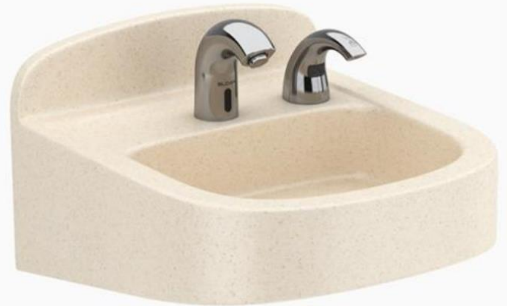
Shown: SloanStone ELS-41000 Sink in Sand (SS) with SF-2100 Faucet and ESD-2100 Soap Dispenser