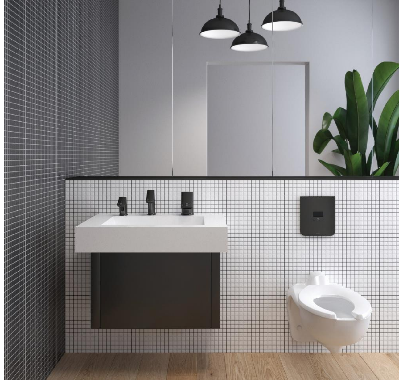
Shown: CX 8158 Sensor Flushometer with ST-2469 Water Closet, AER-DEC Integrated Sink System with BASYS EFX-250 Sensor Faucet, ESD-500 Soap Dispenser, and BASYS Hand Dryer (for AER-DEC only) in PVDGR Graphite Finish .

For on-deck options – enclosure styles available to limit access to refill bottle