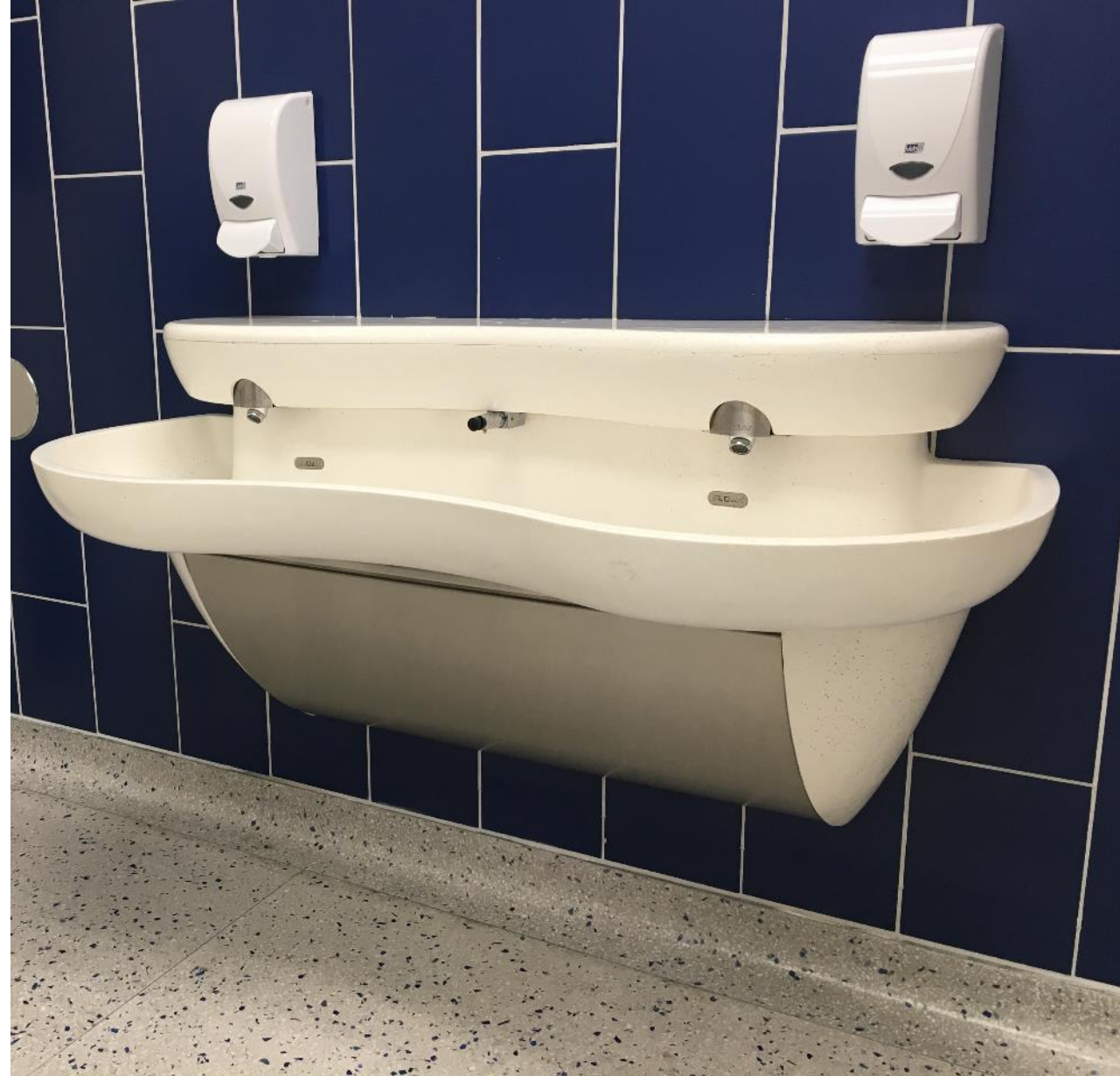
Shown: SloanStone EW-72000 Sink with Integrated Faucet and Soap Dispenser in White

For on-deck options – enclosure styles available to limit access to refill bottle