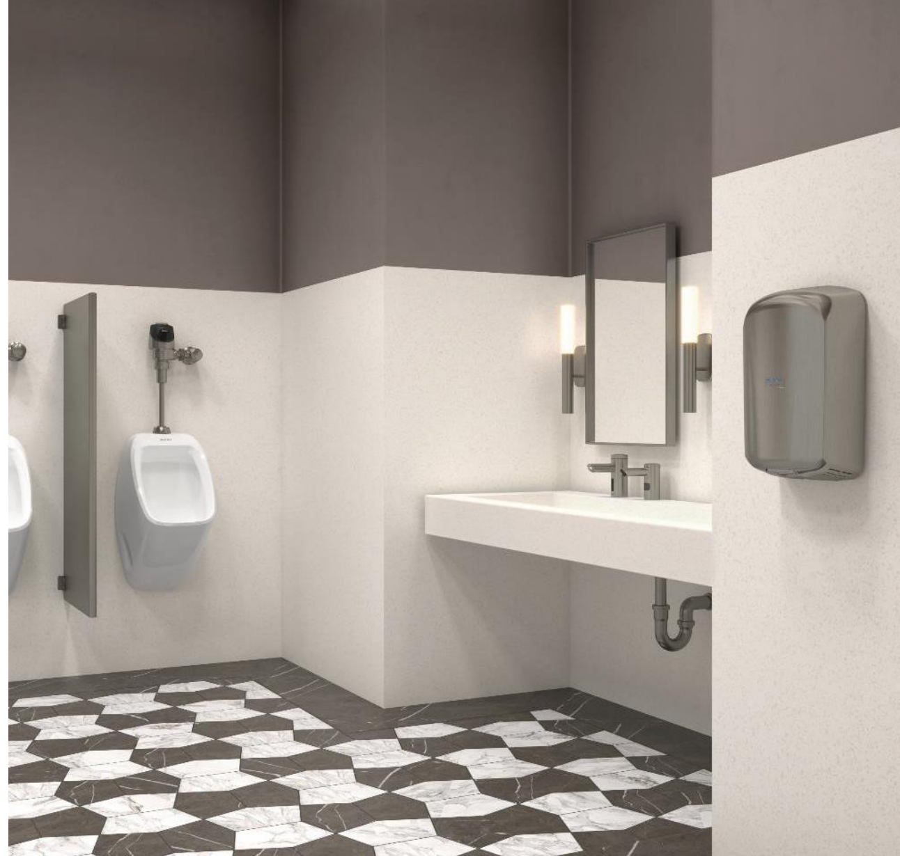
Shown: DSG-81000 Gradient Sink with EAF-250 Faucet and ESD-2000 Soap Dispenser, G2 8186 Sensor Flushometer with SU-7409 Designer Urinal, Sloan Optima Air Hand Dryer