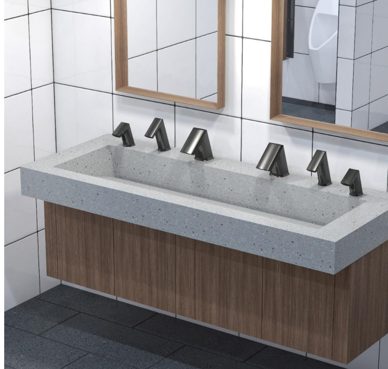
Shown: Sloan DSG-82000 Gradient sink in Corian Blue Pebble with BASYS EFX-250 Faucet, ESD-400 Soap Dispenser and BASYS Hand Dryer all in PVD Graphite . In mirror HYB-7000 Wall-Hung Urinal.