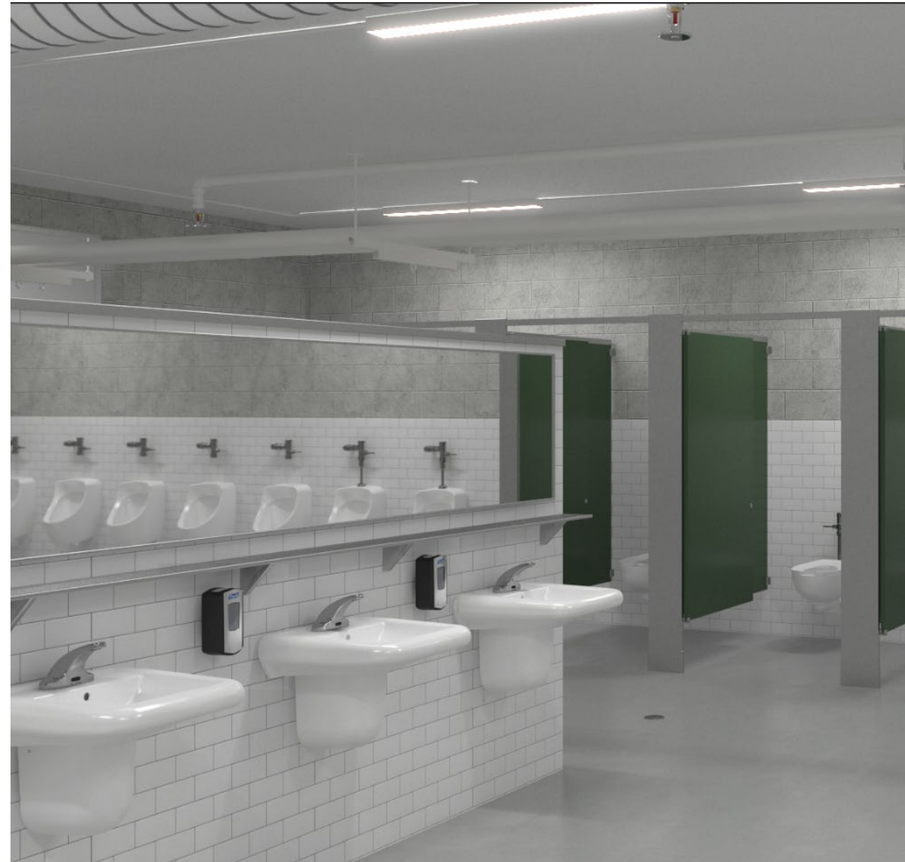
Shown: SS-3065 Wall-Mounted Ledgeback Vitreous China Lavatory with SF-2300 Faucet and Wall-Mounted GOJO Soap Dispenser

For on-deck options – enclosure styles available to limit access to refill bottle