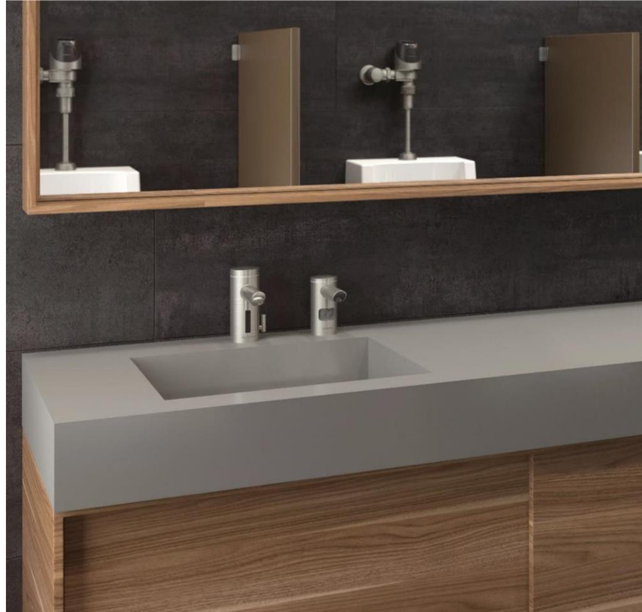
Shown: Sloan DSWD-82000 Weir Deck with Individual Basins and laminated cabinet enclosure. With EAF-275-ISM Faucet and ESD-2000 Soap Dispenser both in PVDBN Brushed Nickel Finish .