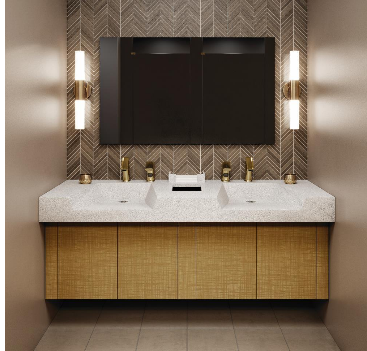
Shown: Sloan DSOF-82000 Open Front Sink with EFX-250 Faucet and ESD-500 Soap Dispenser both in PVDPB Polished Brass Finish .

https://www.gojo.com/en/Newsroom/Blog/2014/Liquid-Soap-Water-Savings-Battle