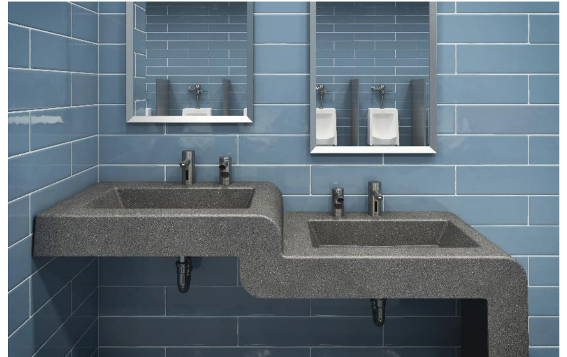
Shown: SloanStone ELWF-82000 Waterfall Sink in Matrix Light Grey with EAF-200 Faucet and ESD-2000 Soap Dispenser.