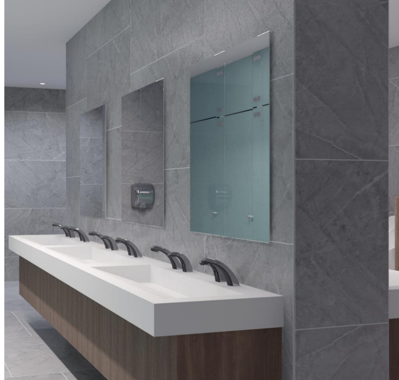
Shown: Sloan DSG-84000 Sink in Corian Glacier White with Laminated Cabinet Enclosure and EBF-85 Faucet and ESD-800 Soap Dispenser