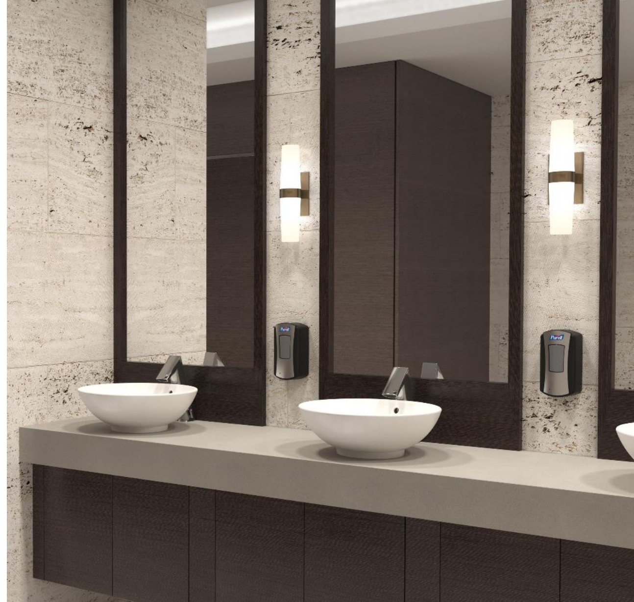
Shown: Sloan DSVR-83000 Vessel Sink with Corian Linen Countertop and Laminated Cabinet Enclosure with BASYS EFX-200 Faucet and Wall-Mounted GOJO Soap Dispenser